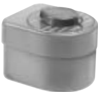
G20 & G58

W20 (20 watt coil): Water and dust-tight polyester solenoid enclosures are part of the coil and are completely molded. They meet NEMA-4X requirements for indoor and outdoor service and are both water and dust-tight, and suited for corrosive atmospheres compatible with polyester and nylon. Valve pictured on front of this brochure is shown with W20 coils. The coils come standard with an unlighted 1/2" NPT female external connector assembly. This type of connector allows internal electrical connection to be made easily while disconnected from the coil. The external cable connection to the housing may be arranged at any one of the 4 angles (90° increments) to facilitate valve installation. A connector assembly can also be ordered with an optional indicator light which shows when the solenoid is energized. The connector meets DIN 43650 Form A.