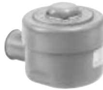
E20 & E58

General purpose solenoid enclosures have pressed steel housings epoxy coated for general purpose NEMA-1 applications – indoors and where atmospheric conditions are not a problem.